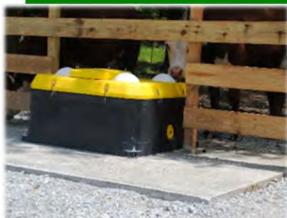
313 North Parkway Jackson, Tennessee 38305