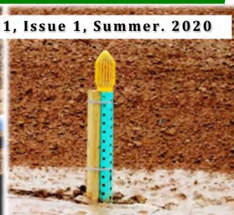
Volume 21, Issue 1, Summer. 2020